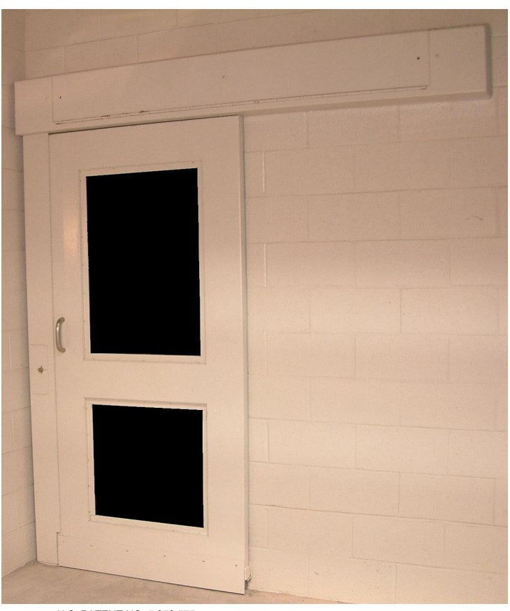
U.S. PATENT NO. 5,070,575

The 7215 is an electrically powered locking device designed for use in applications requiring remote electrical unlocking and manual movement of sliding doors. This motorized locking system provides smooth, quiet operation with minimal maintenance. Low power requirement (24 VDC) provides substantial cost savings in electrical power distribution and controls.